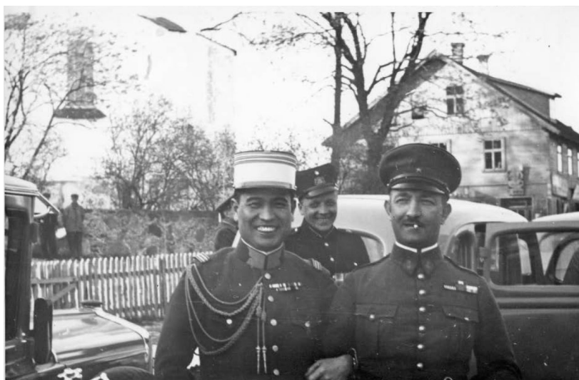
Fig. 3. Lieutenant Colonel Tamotsu Takatsuki (Onouchi’s predecessor) with his French counterpart, Jacques Hoppenot (1939).

Then, between 25th and 27th of July, Onouchi travelled to Stockholm to meet Lieutenant Colonel Toshio Nishimura, then military attaché to Finland and Sweden. 74 There is no official record about their conversation, but it was most