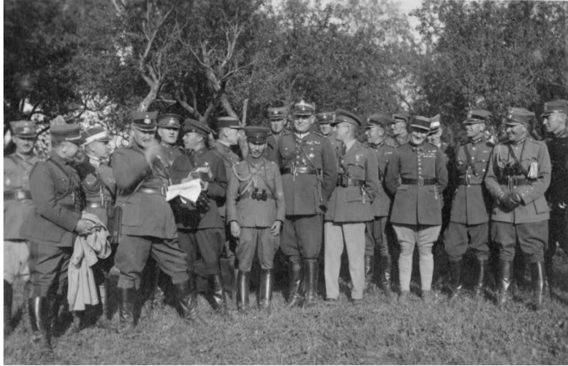
Fig. 1. Lieutenant Colonel Tsutomu Ouchi (eighth from the left) among foreign military attaches to Latvia (1935).

with an excuse of providing a list of the Japanese Army's rations to the Estonian General Staff, of course his actual intension was to maintain the communication with the Estonian military officials. 26